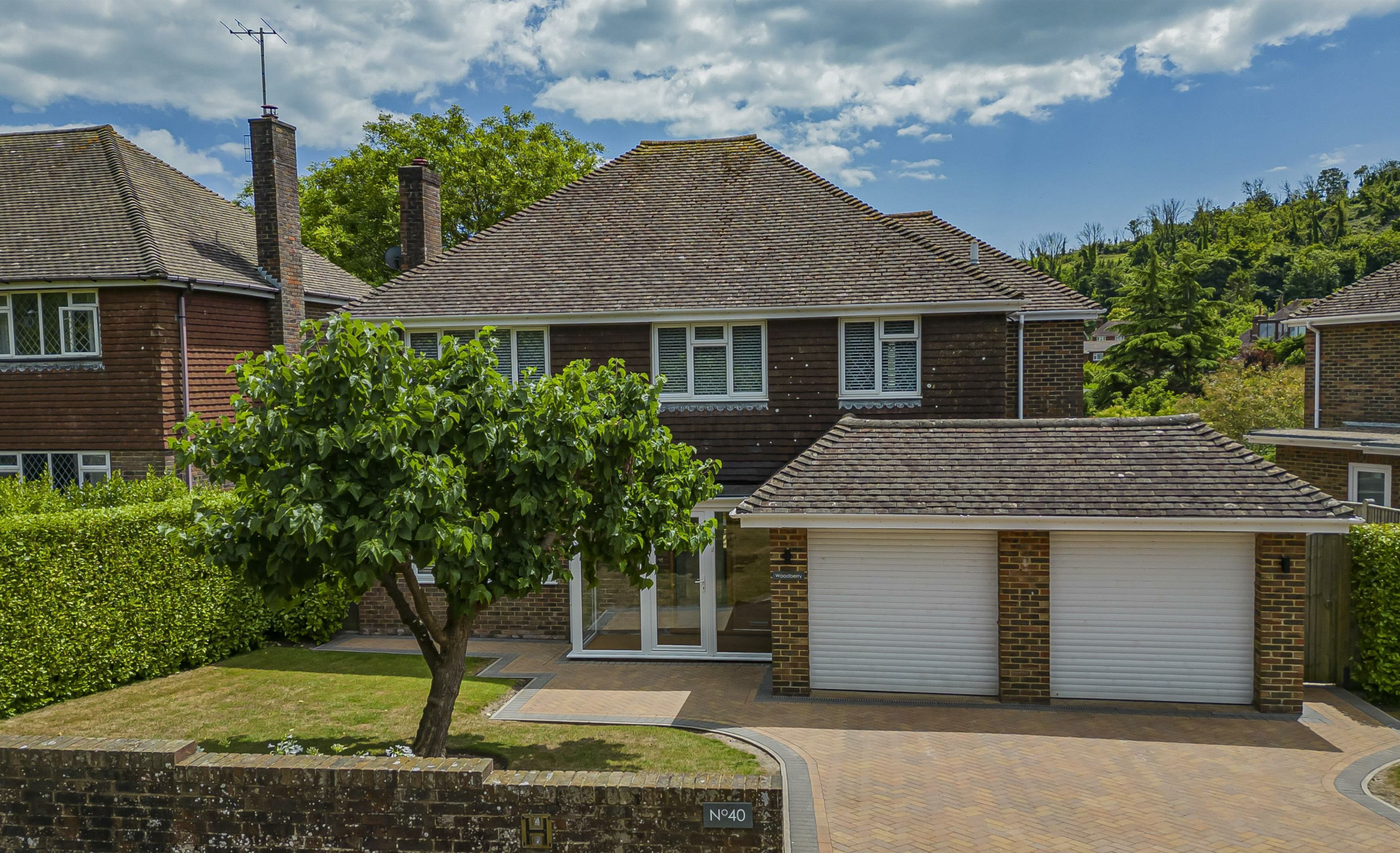
Woodberry, 40 Cranborne Avenue, Eastbourne, BN20 7TT